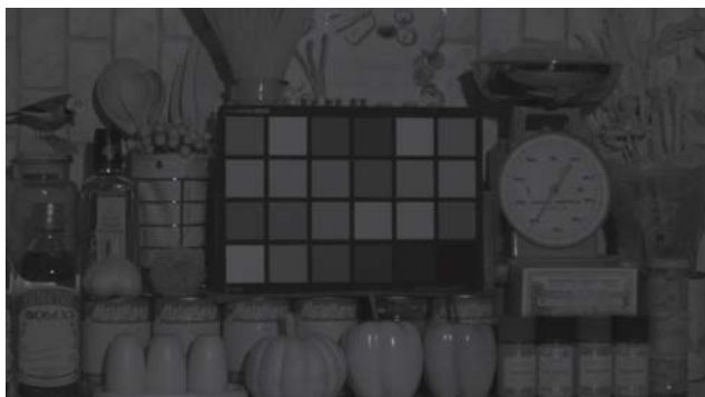
Existing IMX236LQJ Internal gain 0 dB

Condition 2: 0 lx (850 nm IR) F1.4 (Full HD image, 30 frames/s)