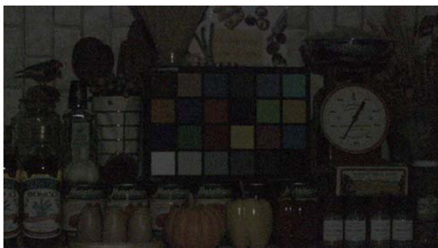
Existing IMX236LQJ Internal gain 48 dB

Condition1: 0.08 lx F1.4 (Full HD image, 30 frames/s)