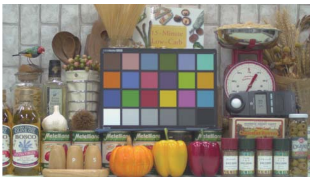
IMX290LQR (Internal gain 0 dB)

Condition: 400 lx F1.4 (Full HD image, 60 frames/s)