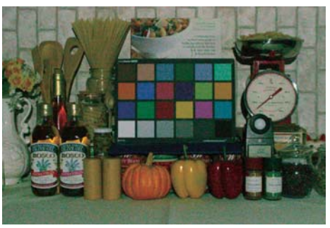
1 lx LLP mode internal gain 51 dB, F1.4