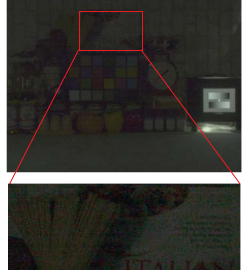
A/D conversion 14 bit mode