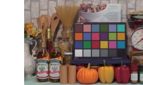
1000 lx HLP mode internal gain 12 dB, F5.6