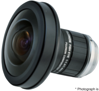
* Photograph is a similar model.

Applicable camera (model) 1 2/3 1/2 1/3 1/4 For Security